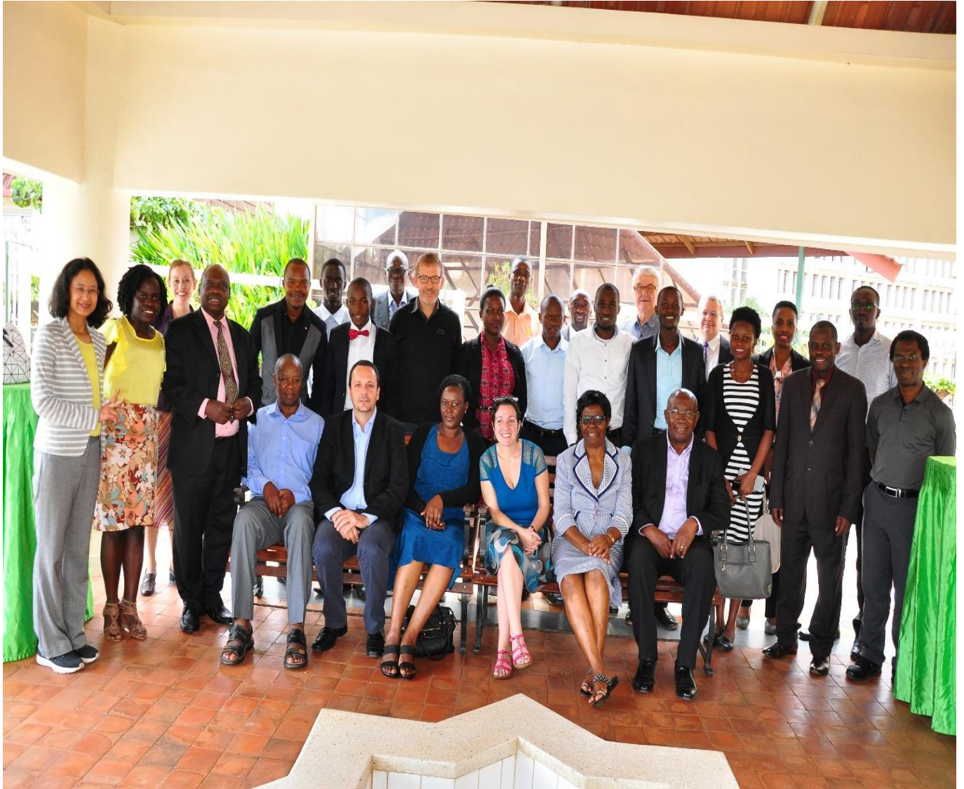
Some Participants at the Colloquium on Coffee